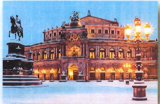
A lovely snowy evening at the Semperoper (Semper Opera House) in Dresden.