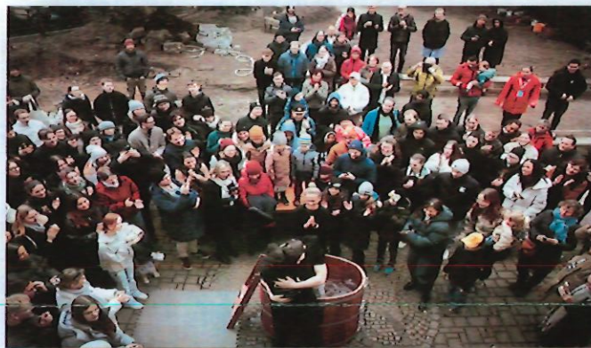
Our Baptism Sunday in January. It was SO cold outside, but 10 people were baptized in Dresden. In total, from all the Zeal Church locations, more than 30 people were baptized on that Sunday.

As always, I am grateful for your prayers and support as I share with you about how I truly have been. Thank you for continuing to lift me up in your prayers.