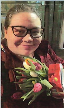
With my birthday gifts from the Zeal Dresden leadership team.

Continuing from the end of last year, I have had a difficult couple of months. I will not go into all the details, but have I struggled mentally, physically, and spiritually over the holidays into the new year. Through the recommendation of my doctor and my spiritual leaders, it was time for me to take a pause from regular working hours. Through most of December, all of January, and most of February, I was off on a medical leave.