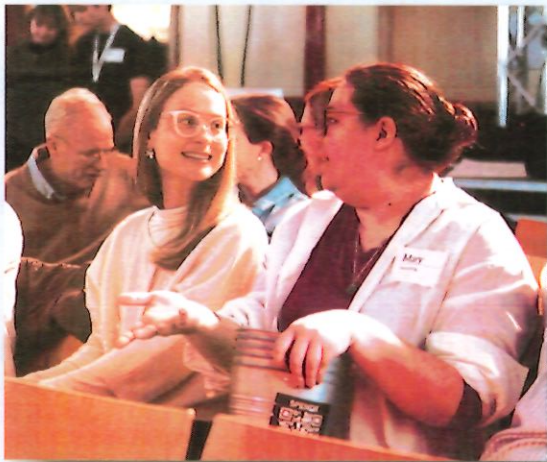
Chatting after church service.