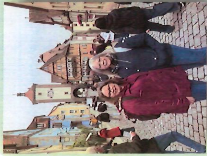
Visiting Rothenberg ob der Tauber with my mom (Dad is taking the photo).

I have always ascribed to be as honest as possible in my newsletters. Some seasons have been joyous over the years. Unfortunately, this has been one of the most difficult seasons for me.