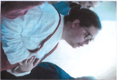
Worshipping during Sunday Service at Zeal.