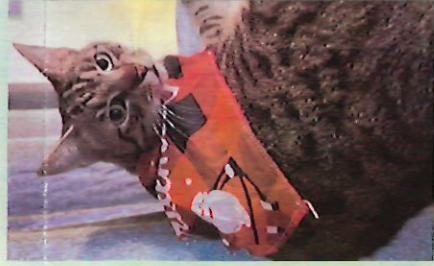
One of my last photos of Haru was in his Christmas bandana.

Everything compounding has me struggling. I desperately need your prayers and support. This Christmas will be the most difficult one I have ever experienced so far away from all of you.