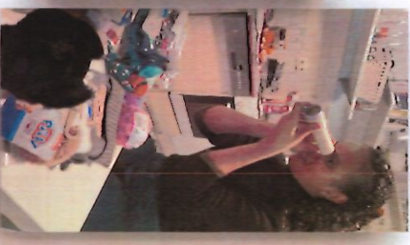
My small group packed gifts for Operation Christmas Child.