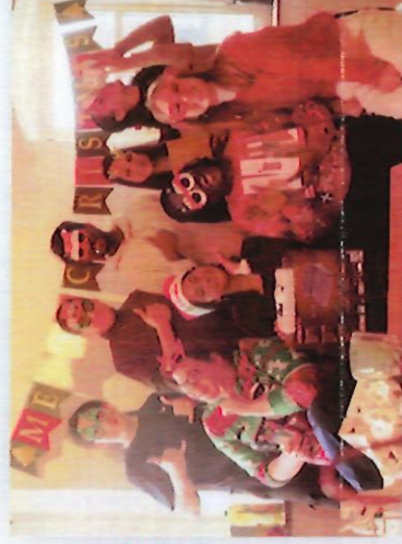
The Zeal Dresden International Group's Christmas party.