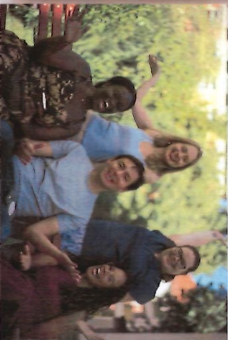
My International Small Group celebrating the baptism of one of our members (the man in the middle).