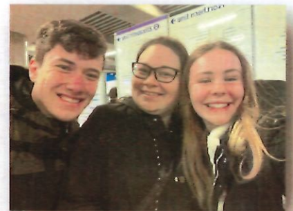
Meeting up with a couple of my German teammates, who also happened to be on vacation in London at the same time as me!

I love being part of an missions' organization that is focused on making a difference and a church planting team that has such vision for sharing the Gospel in the East German region.