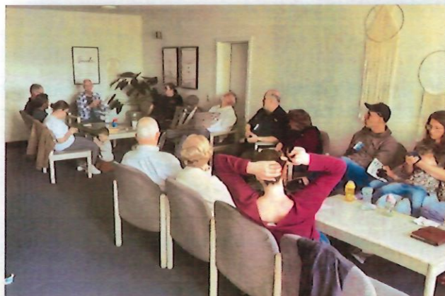
On the left, a meeting with a large portion of the Kontaktkmission USA leadership at the Mitarbeitertagung .