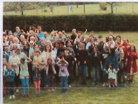
Some of the Kontaktmission missionaries and their families as we made a video, dancing to a children's worship song.