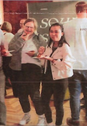
One of my favorite photos that I took on Easter Sunday.