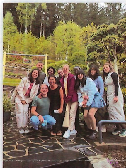
On the right, we are celebrating the birthday of one of the International small group members, with four different continents represented!