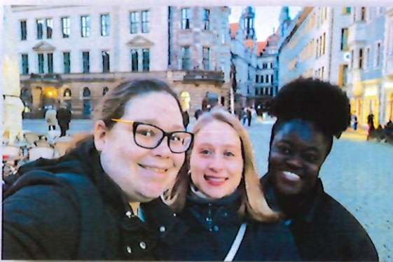
On our way to an International Hangout in our beautiful city!

P.S.: I will be visiting the United States from June 26th—July 16. I would love to catch up with as many supporters as possible. Hope to see you then!