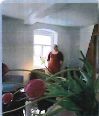
Taking a break in our new office!