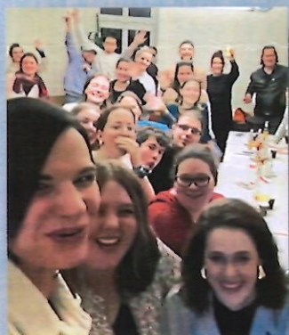
The Dresden Leader's Night in February, welcoming our visitors from Trader's Point Christian Church.