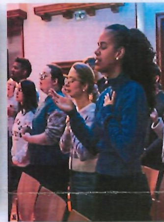
Worshipping at our new location!