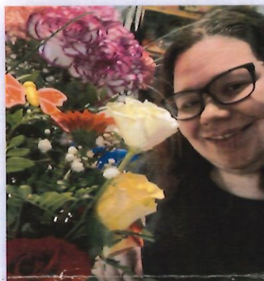
Posing with the beautiful bouquets I was given on my birthday. I celebrated by having a game night with some of my friends.