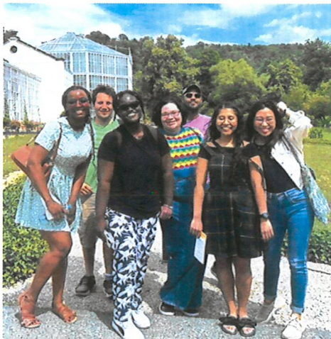
International Small Groups Hangout. About every 6 weeks we combine all of our small groups together for fellowship. This time we visited Schloss Pillnitz , a castle on the Elbe.