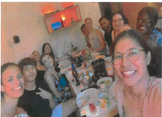
The International Small Groups got together in August at a going away party for one of the group leaders and her husband.