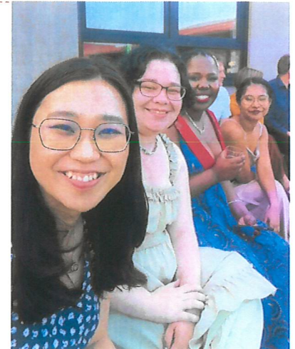
Celebrating at the third wedding I have attended this year. The bride is behind me in the beautiful blue and red dress.