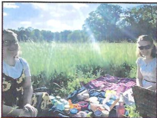
Our Bible Study group had a summer picnic in Großer Garten , a big, beautiful park near where I live.