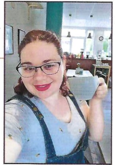
A recent photo of me in the Café