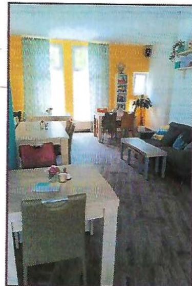
The beautifully renovated Café Story!

My Bible Study group meeting behind a castle on the Elbe River for a picnic in May.