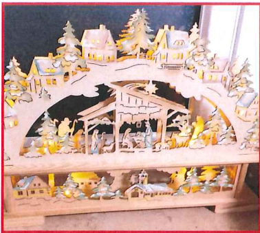
My "new" Schwibboggen, that one of my neighbors gave away—for free! I love that it has such a beautiful Nativity scene.