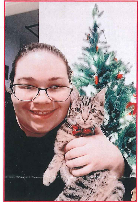
Meet my new furry family member, Haru!