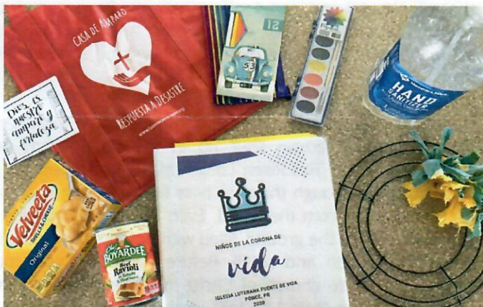
Sunday School Packet with extra crafts and food.