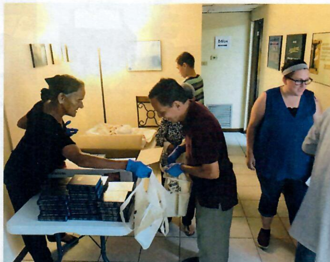
Packing bags at Fuente de Vida of hand sanitizer, soap, and a Bible. These are now being distributed by our neighbors (local pharmacy).