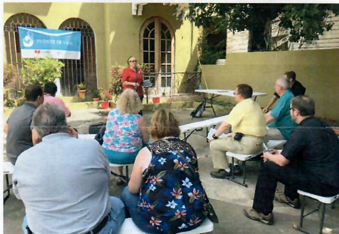
March 2020 Puerto Rico Foro